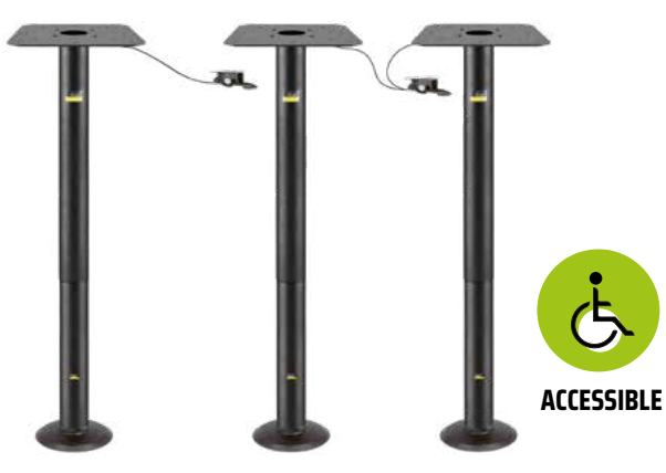
Bolt-Down Base with Pneumatic Post CT7000

Dual Bolt-Down Bases with Pneumatic Posts CT7001